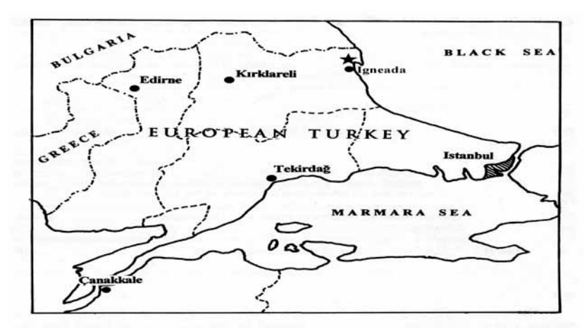
Figure 1. The location of Silene sangaria («)

chromosomes such as S. chalcedonica and S. nutans. Yildiz (1994) reported that the chromosomes of polyploid species are generally smaller than those in the diploid species. Similarly, Bennett et al. (2000) reported that the genome sizes of polyploids are smaller than their diploid relatives. The reason for the decrease in genome size is usually the deletion and elimination of the repeating parts on chromosomes (Siljak-Yakovlev et al., 2005). More data are needed for the evaluation of nuclear DNA amounts of Silene concerning 1C-values of this genus. The 1C-values and chromosome numbers of the Silene species whose genomes are known are shown in Table 1. The data are presented by combining available data from current literature and the results of this study. S. sangaria is the only polyploid species among the ones whose genome size is known.